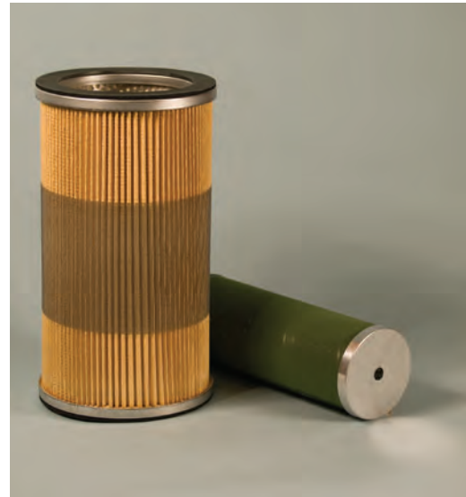
O-81588 and SO-415VX5 Separator

For more information on the Vel-Max® Filter Vessel please refer to data sheet VEL1961. Vel-Max® and Aquacon® are registered trademarks of Parker Hannifin.