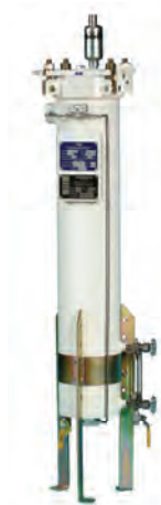
Vel-Max® (for DFO-6)