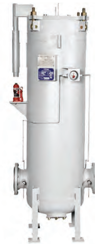
DVF Series (for DFO-6)