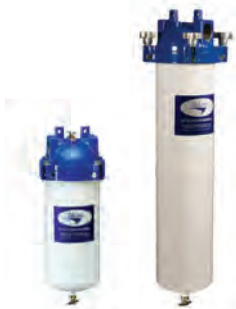
VF-61 & VF-62 (for DFO-5)